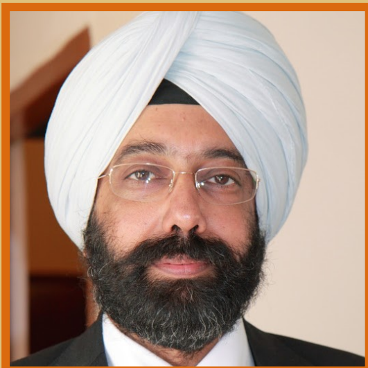
ADV. AMIT SINGH SETHI ADDITIONAL ADVOCATE GENERAL PUNJAB BATCH OF 1986